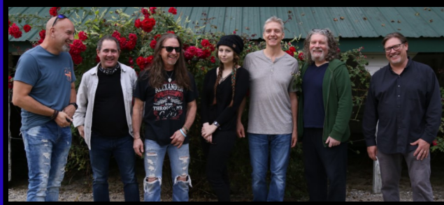
Shadowland at the beautiful Worsell Manor

at Pickett's in Maplewood, downtown Westfield and a private event at the Indian Trail Club - we also officially launched our new website and our brand new Twitter page! Please check them out and "like" and "follow" us! ... We've also been doin' our weekly Quarantunes and will continue to play these Friday night shows, live on my Facebook page in the immediate future. We absolutely love doing Quarantunes