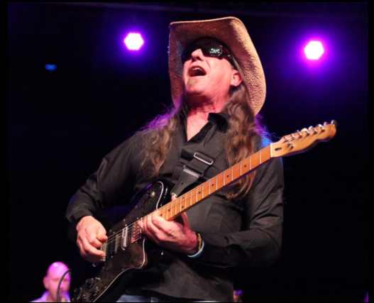
With The Jukes at the Hard Rock Atlantic City

SHADOWLAND: I recently did an interview with American Blues Scene, one of the most popular blues music websites on the internet. I was talkin' about many things - Shadowland, my influences, the blues and just music in general. It was a lot of fun and it was just posted on the ABS website . In addition to the interview, there is a really great review of the Shadowland debut album - please check it out. I also encourage you to click around the ABS website for great articles, reviews and interviews with some of the biggest names in music ... We recently had a recording session and we taped Shadowland performing a few of the songs live. It was a fun session and we're