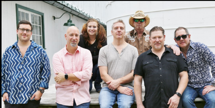
Shadowland at Worsell Manor - what a great place!