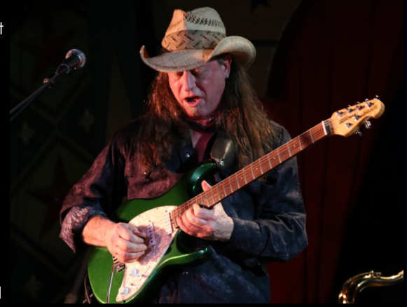
With Shadowland at Roxy & Duke's