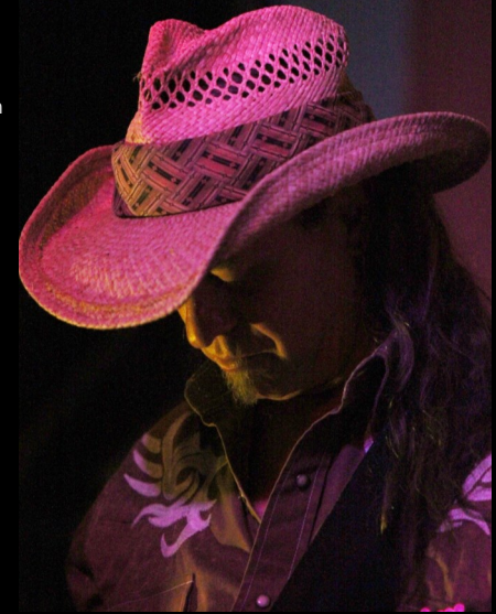
With Shadowland at Hat City Kitchen