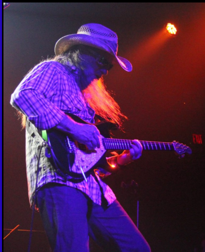
At The Birchmere with The Jukes