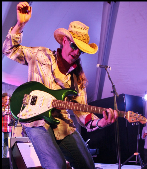
Tearin' it up in Truro with The Jukes