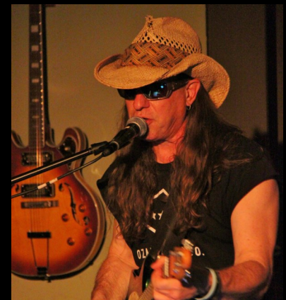
Hittin' the after-party at 12 Grapes in Peekskill with The Jukes