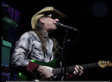
At B.B. King's with The Jukes